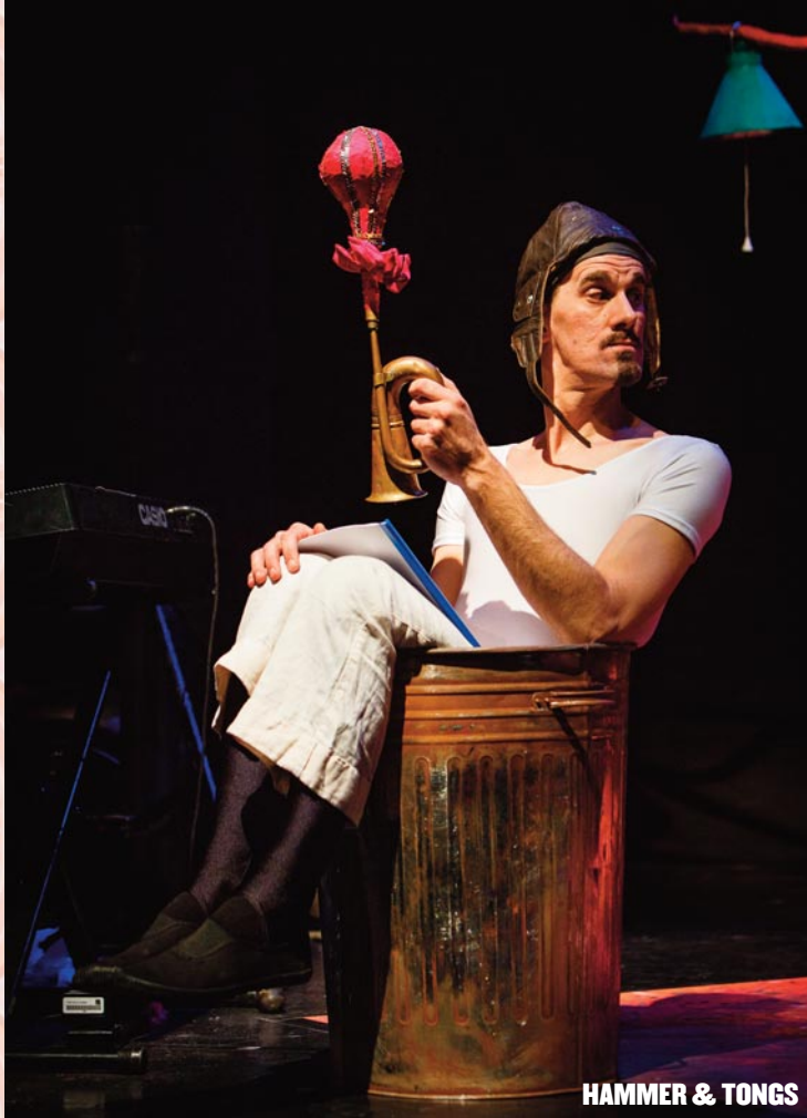
HAMMER & TONGS